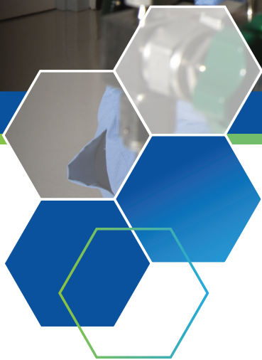
An analyst works with the gas manifold in a laboratory.